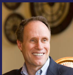
Stephen M.R. Covey