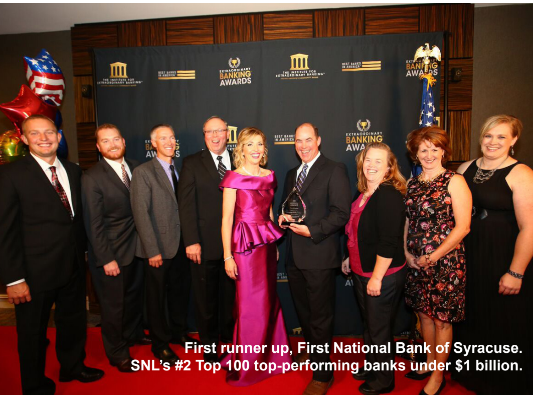
First runner up, First National Bank of Syracuse. SNL's #2 Top 100 top-performing banks under $1 billion.